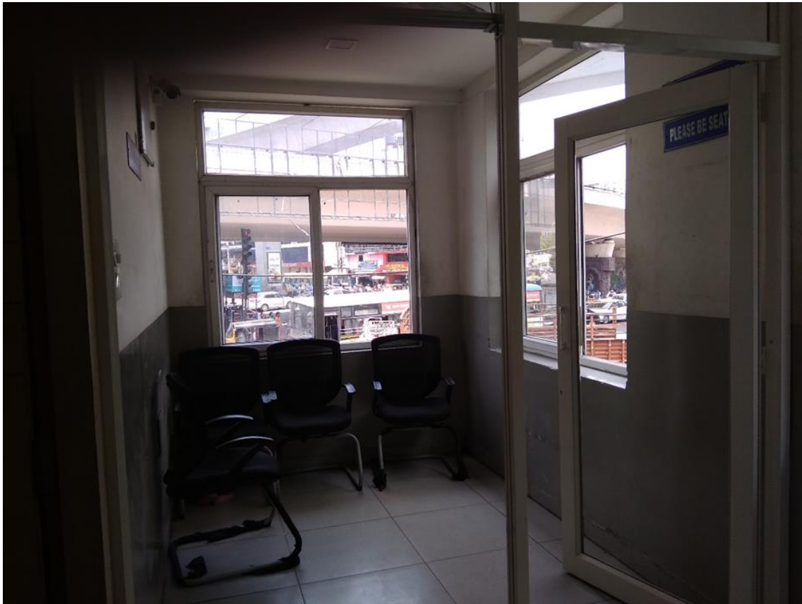
Punjagutta Police Station